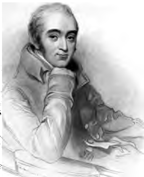
Engraving of the artist