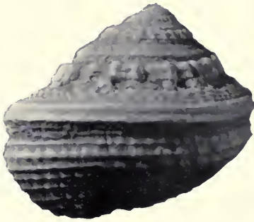
FIG. 109. Neotype of Glabrocingulum grayvillense , P-16649 (1) Chicago Natural History Museum; \times 4.2 .