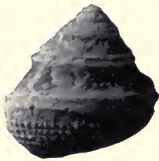
FIG. 108. Paratype of Glabrocingulum beggi , no. S 9064 Hunterian Collection, Royal Scottish Museum; \times 7.3 .