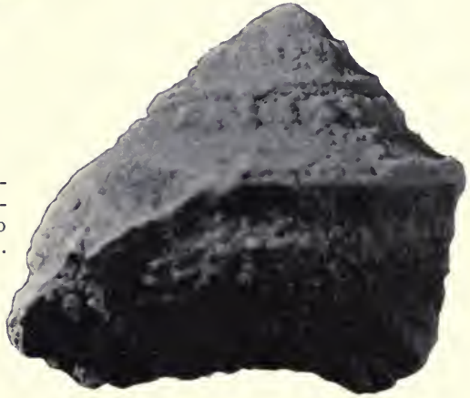
FIG. 110. The largest paratype of Glabrocingulum grayvillense , P-16649 (3) Chicago Natural History Museum; \times 5 .

logued under P16649, there are three specimens which are listed as having been collected by Henry Pratten in the Grayville locality. Since the species is named for the town, and since the only collecting area near the town is quite restricted in extent, making it possible for the specimens to be localized, I am designating as the neotype of the species the specimen marked no. 1, and the type locality as follows: three-inch limy marl bed in gray shale, 20 feet below the railroad tracks on the west bank of the Wabash River near Grayville, White County, Illinois, SW \frac{1}{4} of SE \frac{1}{4} of NW \frac{1}{4} of Section 21, T. 3 S., R. 14 W. The neotype and the largest paratype are shown (figs. 109-110).