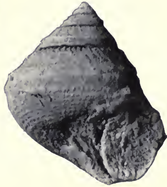
FIG. 107. Apertural view of figured paratype of Glabrocingulum beggi , no. 1939-7 Dunlop Collection, Royal Scottish Museum; \times 8 .

more elevated above the whorl surface and the suture drops below the selenizone relatively more than before. Both of these growth trends appear also in G. grayvillense . The ornamentation on these species lacks the enlarged nodes near the suture characteristic of Glabrocingulum sens. str.