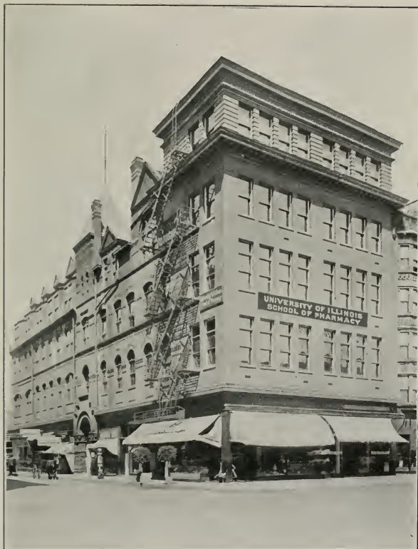
FORMER HEADQUARTERS OF THE SCHOOL OF PHARMACY AT MICHIGAN AVENUE AND TWELFTH STREET (ROOSEVELT ROAD)