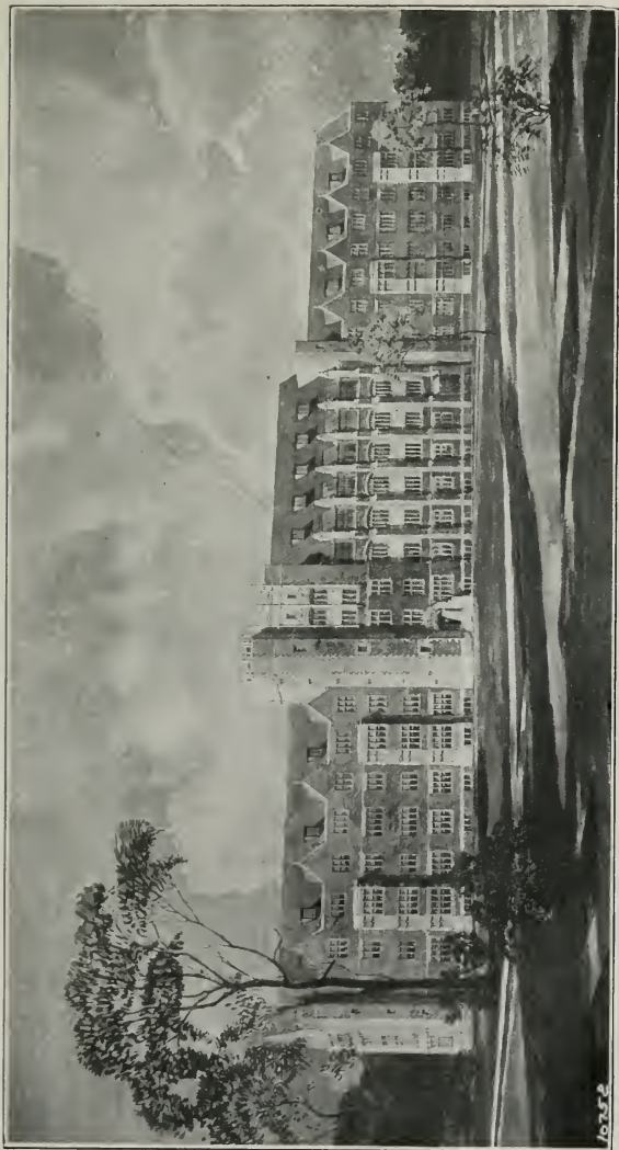
FIRST UNIT OF THE NEW COLLEGE OF MEDICINE GROUP