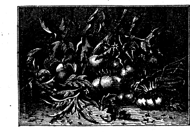
THE KITCHEN BOUQUET.

"The Chicago Republican" says, that "'The Fringed Gentian,' by A. R. Newman, is one of the most exquisite flower-pieces it has been our lot to see. We can readily believe that it cost more labor than many larger and more pretentious pictures. A slight description will indicate the difficulties of the task. In front of a mass of half-decayed limbs, which form a background, - the most pretty woodcolor shades graduating into one another, - springs up the fresh gentian stalk, bearing its pale-green leaves, and radiant with the bright blue of its crowning blossoms. The whole is a sermon, - nay, better, a poem, - teaching of the presence of abounding life amid the ever-visible tokens of mortality. Artistically, nothing could be more perfect than the contrast of colors, - the living blue and green set off against the sober shades of the dead, decaying wood and leaves."